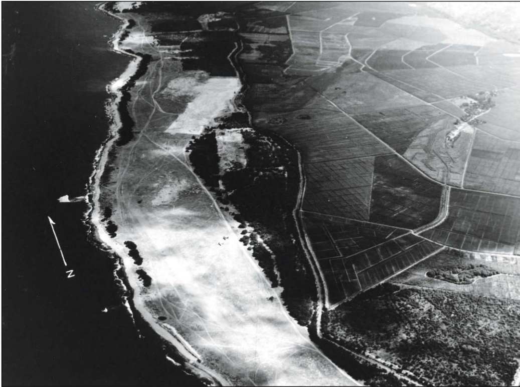
Figure 3.17. Aerial photograph of what would become Barking Sands Army Air Base, looking north, September 1941.