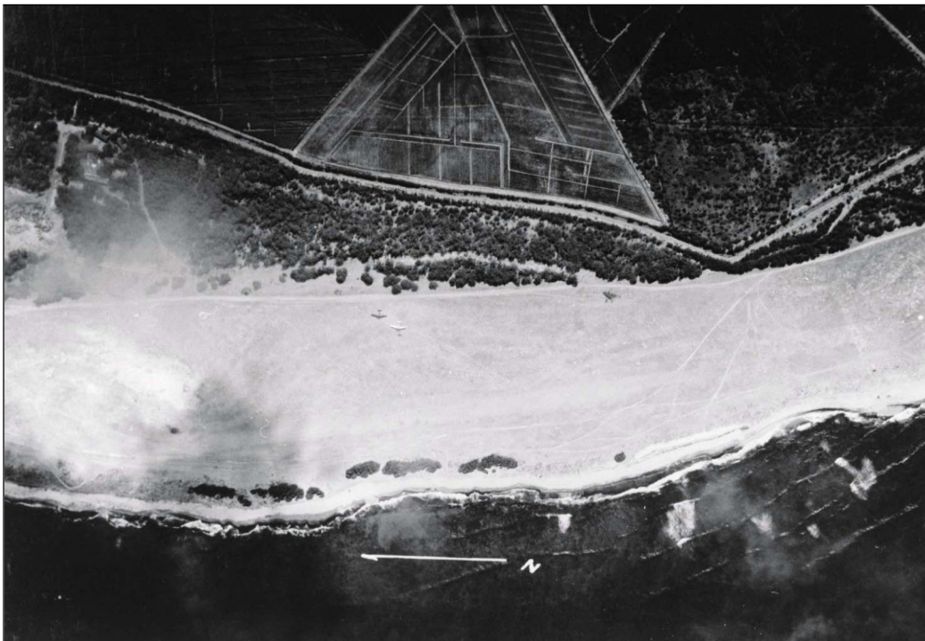
Figure 3.18. Aerial photograph of what would become Barking Sands Army Air Base, September 1941.