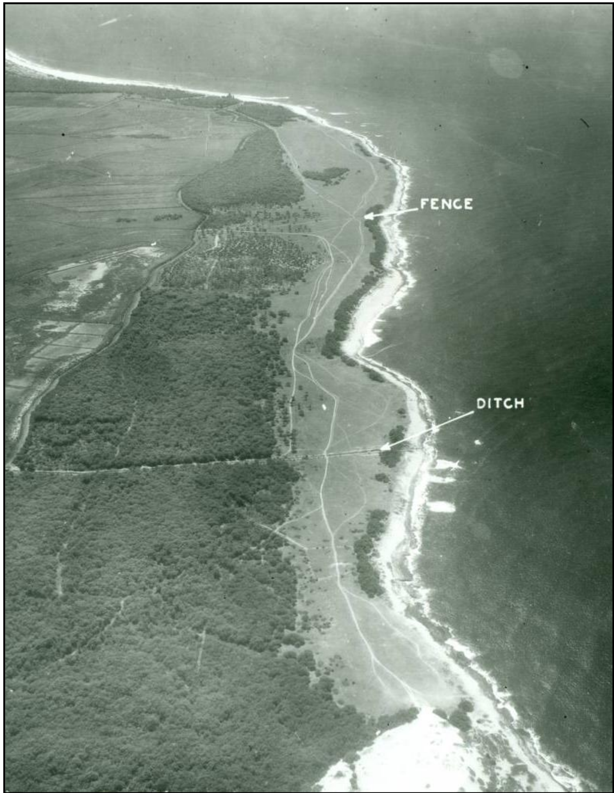
Figure 3.14. Photograph of Mana Airport (also known as Barking Sands Landing Field), looking south, 1935.